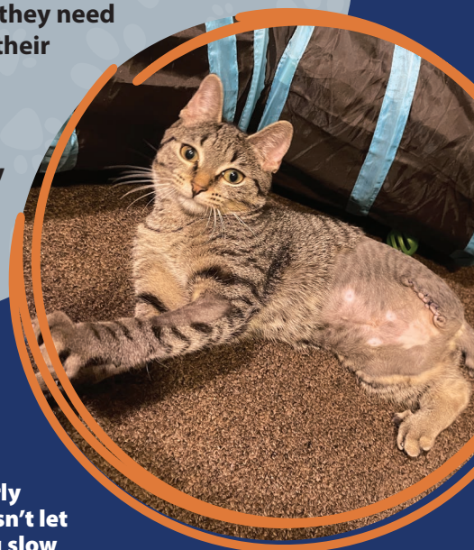
Toad, formerly Teonna, doesn't let a missing leg slow her down.

Your support helps transform the lives of injured and abandoned animals like Toad, giving them the expert care they need to thrive in their new homes. Thank you for making these happy endings possible!