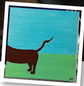
Boog's crooked tail inspired a staff member to paint "Boog's Butt" as a gift for his new parents.